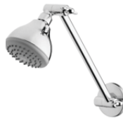
Ivy Shower Arm & Rose