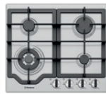
Westinghouse 600mm Gas Cooktop