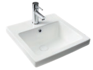
Seima Kyra 017 Square Basin