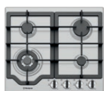
Westinghouse 600mm Gas Cooktop