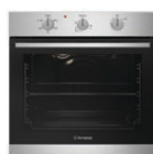
Westinghouse 600mm Electric Oven