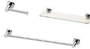
Radii 600mm Single Towel Rail, Toilet Roll Holder & Glass shower shelf in Chrome