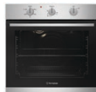
Westinghouse 600mm Electric Oven