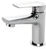
Phoenix Arlo Basin Mixer