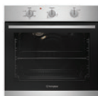
Westinghouse 600mm Electric Oven