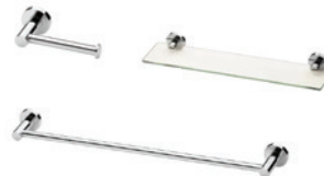
Radii 600mm Single Towel Rail, Toilet Roll Holder & Glass shower shelf in Chrome