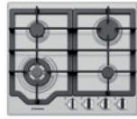
Westinghouse 600mm Gas Cooktop