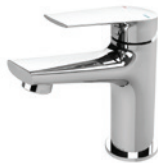
Phoenix Arlo Basin Mixer