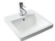
Seima Kyra 017 Square Basin